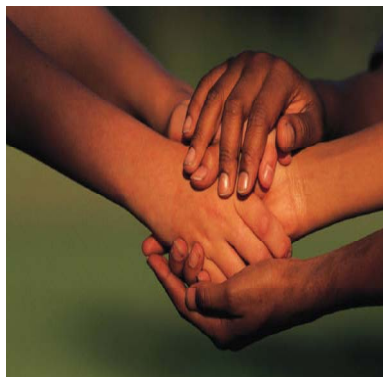
March 15th Workshop Understanding and Managing Depression CLT 117